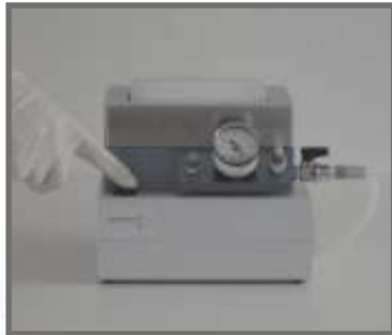
Push the "START" button and filtration starts automatically