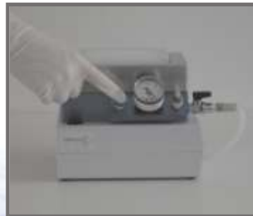
After filtration is terminated push the "VENTILATION" button