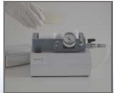
Filtered sample can be collected from the receiver plate