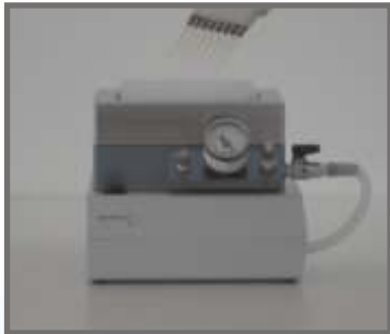
Pipette sample into the filter plate